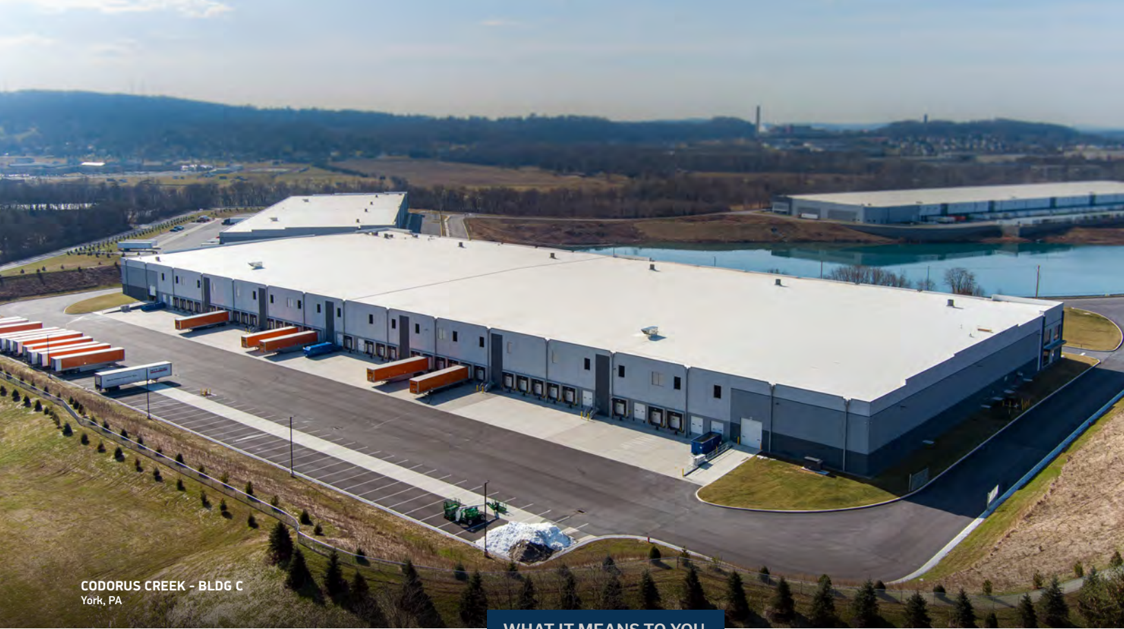
CODORUS CREEK - BLDG C York, PA