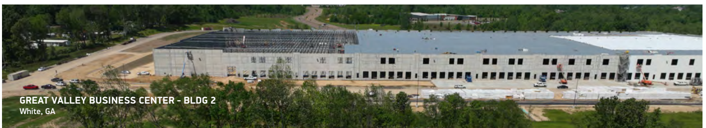
GREAT VALLEY BUSINESS CENTER - BLDG 2 White, GA

Established long-lasting partnerships with architects, construction firms, lenders and other industry specialists, coupled with quick decision-making, create a flexible and nimble delivery of product to market. Tailored, personal responses and organized, efficient systems have earned us the status for proactively delivering beyond partner and client expectations.