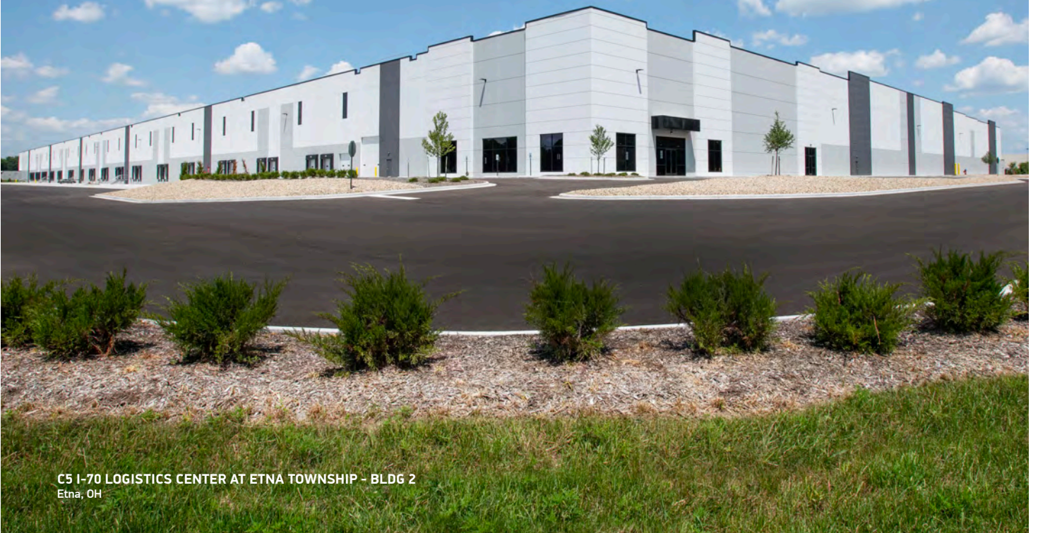
C5 I-70 LOGISTICS CENTER AT ETNA TOWNSHIP - BLDG 2 Etna, OH