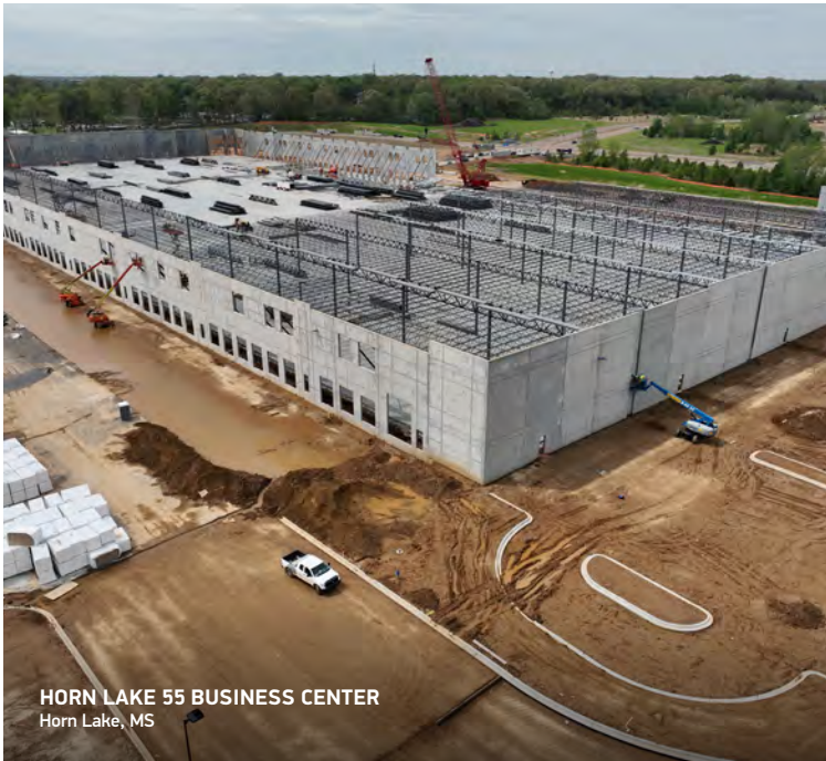
HORN LAKE 55 BUSINESS CENTER Horn Lake, MS